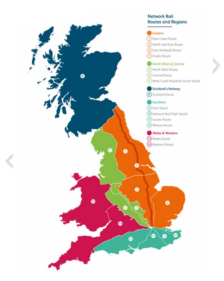
Figure 2: Proposed regional division of Network Rail (indicative / subject to consultation)

Regions and Routes have differing challenges and needs, with varying practices, performance levels and degrees of efficiency. The Office of Rail and Road (ORR) is tasked with ensuring consistency between Regions and Routes by encouraging them to excel and share best practice. It is essential that these differences do not supress future railway connectivity in the North.